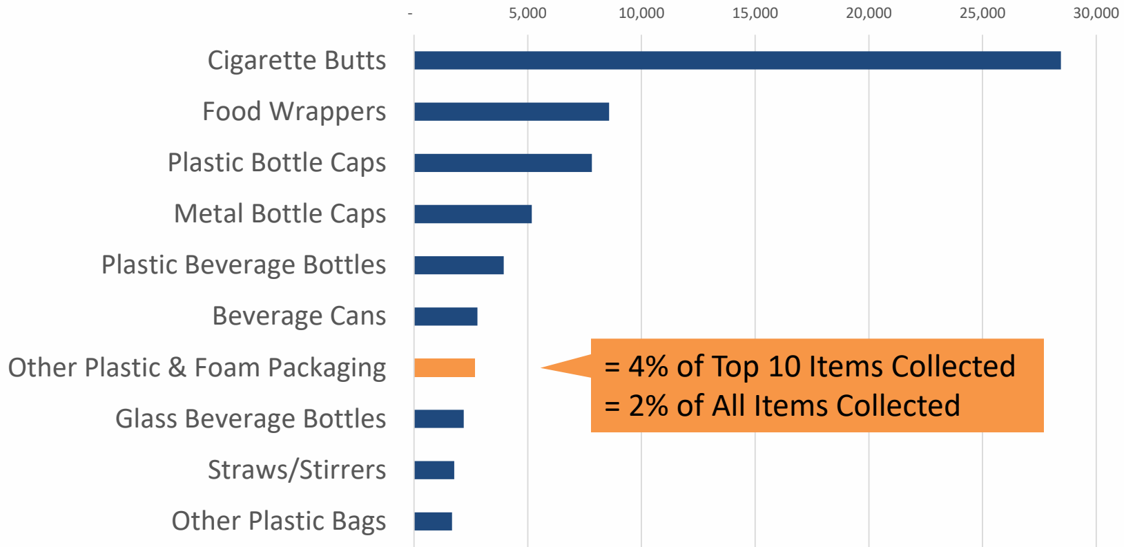
Top 10 Items Collected in Hawaii (2015)